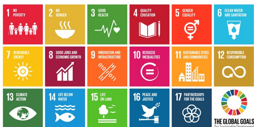
Figure A1.1: Sustainable Development Goals for the UN Agenda 2030