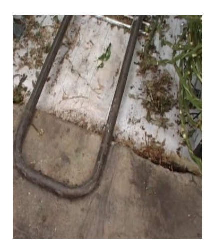
(The stable pipe on the floor to run hot water.)

The source of energy that they use to heat the hot water that they use for these two kinds of pipes is natural gas. They have three boilers for each site of which the byproducts of consumption are water and CO_2 . We condense the water out of the exhaust leaving only the CO_2 , which they then pump into the greenhouse to enrich the greenhouse with CO_2 because the plants will use the CO_2 as part of their photosynthetic process to create sugars.