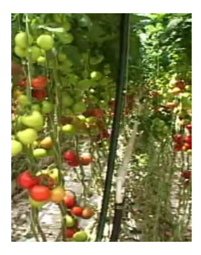
(The movable pipe, which can go up and down across the vines.)