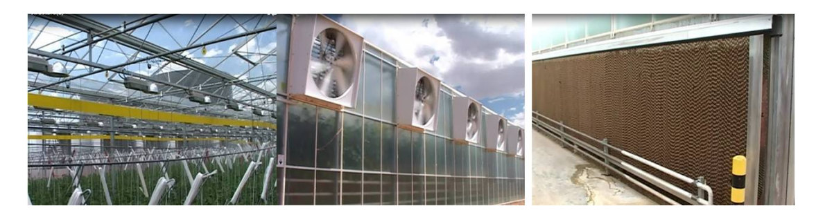
(the greenhouse's roof and cooling system)

would offer the same amount of light transmittance. The greenhouses they use are of considerable height. The reason is because it allows more of a buffer, an air buffer layer above the crop. That way in times of heating they can effectively keep a warm blanket above the crop and also in times that they need to cool the air allows them time or energy savings with the fans. They use a special cooling system when the natural venting could not fulfill the need. They use a cooling system similar to a home evaporative cooler, with the fans on one side and the cooling pad on the other side of the greenhouse. They will pull the air through the greenhouse and exchange the air in the greenhouse with the cooled air coming in from the outside through the pad. This system also helps keep the greenhouse in certain humidity level.